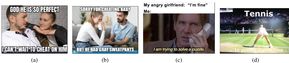
Figure 4: A sample of false negatives from the test set on the misogyny identification task.

score composed of a promising 75% in precision and 71% recall. While performance between stereotype and objectification are close, the system underperformed in the shaming category. We think this behavior is due to the broad kind of both visual and textual content that can convey shameful messages and is hence more difficult to learn. Finally, the model performed best in violence , where it is probably simpler to identify visual clues that let intend a violent message.