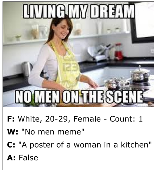
Figure 1: Sample from the training set (top) annotated with Misogynous and Stereotype labels. We enriched the meme with additional information (bottom), namely detected faces (F), web entities (W), caption (C), and adult content (A).

Misogynous memes are an unfortunately common phenomenon. Based on sexist preconceptions, these memes target and degrade women for humor. This intricate nature makes them hard to detect with classical computational models as hate is conveyed by associating known visual concepts with specific textual wording. In the Multimedia Automatic Misogyny Identification task (Fersini et al., 2022) novel systems are required to detect misogynous memes in English. The task is divided into two sub-tasks. Sub-task A requires solving the sole misogynous meme identification (i.e., a binary task). Sub-task B requires recognizing more specific categories, namely stereotype , shaming ,